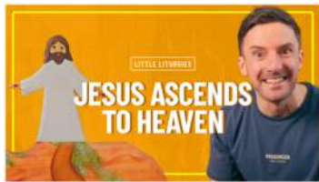
Little Liturgies for children 8 and under Jesus Ascends To Heaven

Click on the images below to watch the videos.