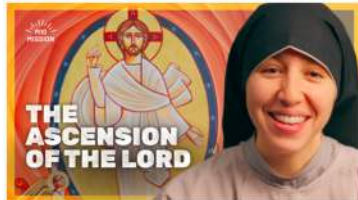
The Mark 10 Mission for children 8+ THE ASCENSION OF THE LORD