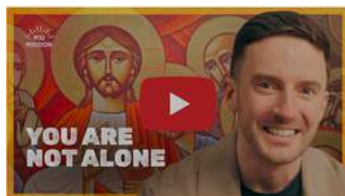
The Mark 10 Mission for children 8+ YOU ARE NOT ALONE