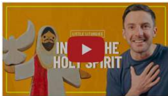
Little Liturgies for children 8 and under INVITE THE HOLY SPIRIT