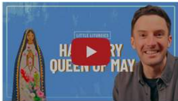
Little Liturgies for children 8 and under HAIL MARY, QUEEN OF MAY

Click on the images below to watch the videos.