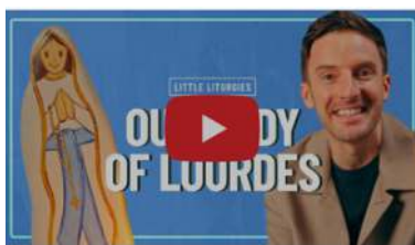
Little Liturgies (for the under 8s)

Click on the images below to watch the videos.