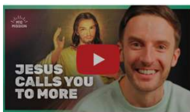
The Mark 10 Mission (age 9+)