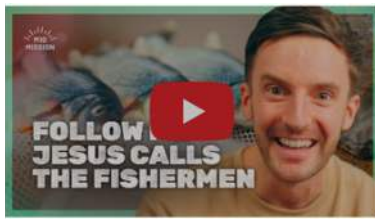
The Mark 10 Mission (age 8+)