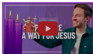
Little Liturgies (ages 4-8)

Click on the images below to watch the videos.