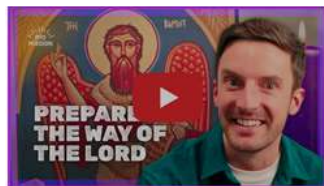
The Mark 10 Mission (ages 8-12)