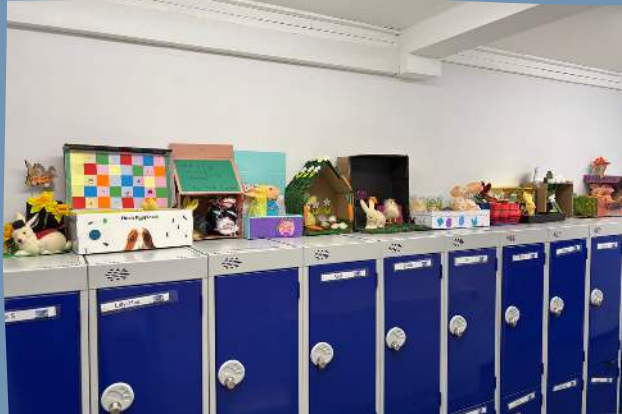
Some of the children's eggcellent entries for the FoSA Easter Eggstravaganza competition!