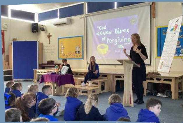
Ash Wednesday Service of Reconciliation