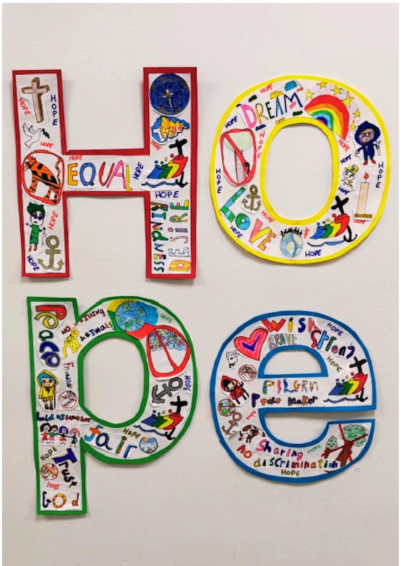
‘Hope’ by our Acacia Class Children