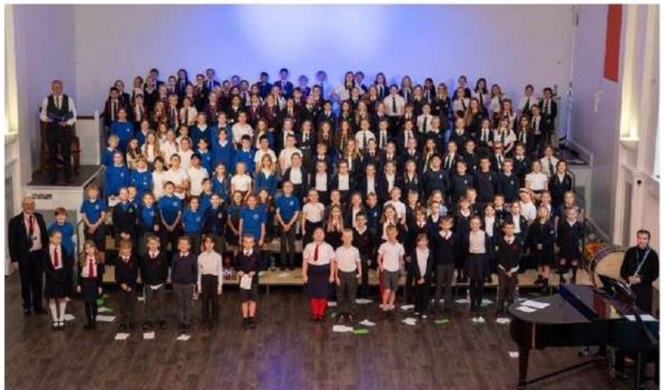
Children from six primary schools performed in a fundraising concert for the RNLI.

A spokesperson for the RNLI said: "All our lifesavers say a big thanks for helping us to keep people safe at sea."